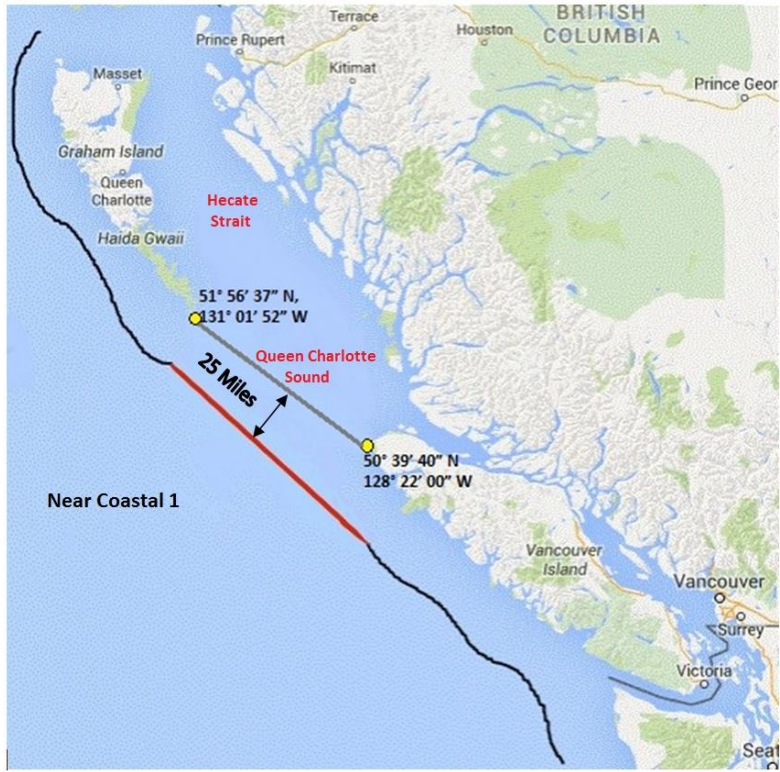
Data©2016 Google Map